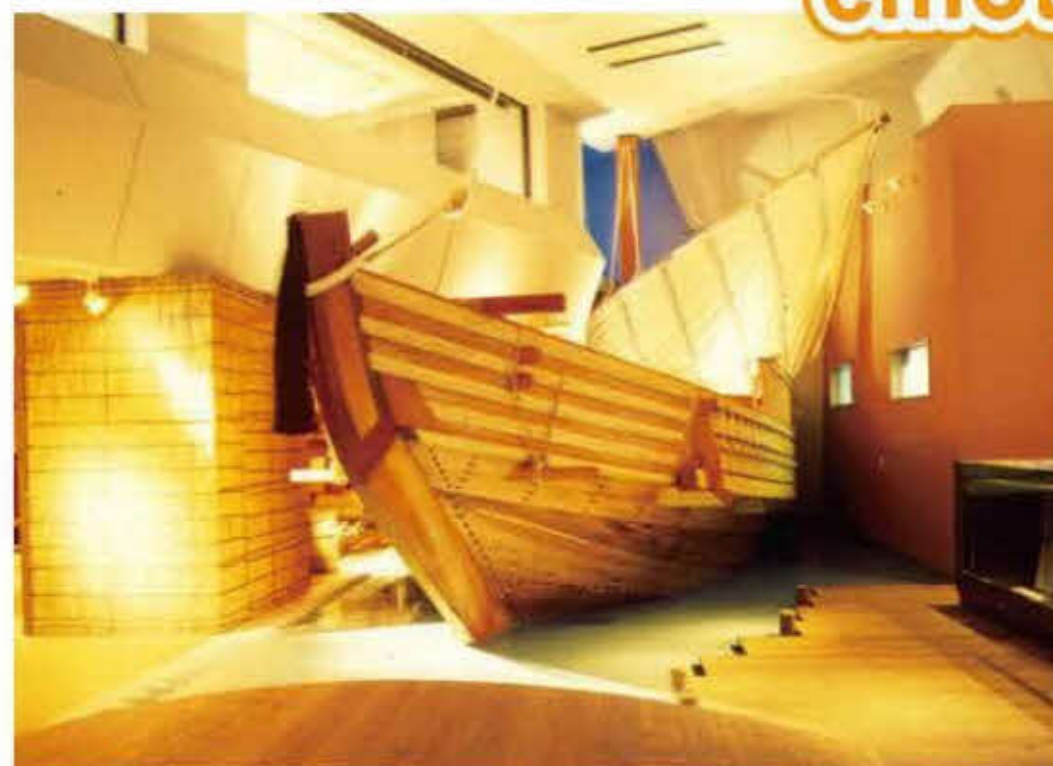
▲ Konpira Ship

Immerse in the Edo emotion with the busy townscapes