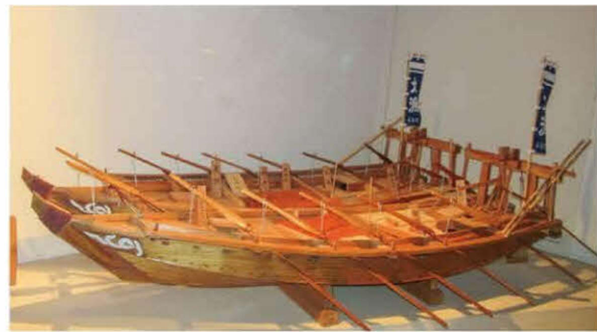
▲ Sea bream net fishing boat