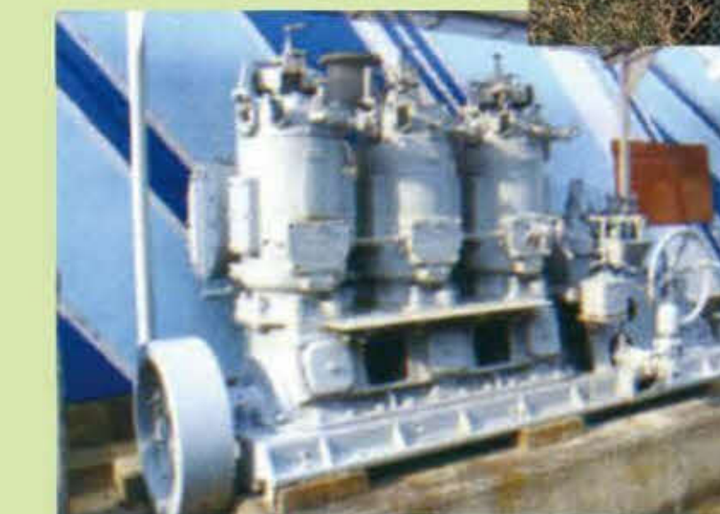
▲ Hot bulb engine