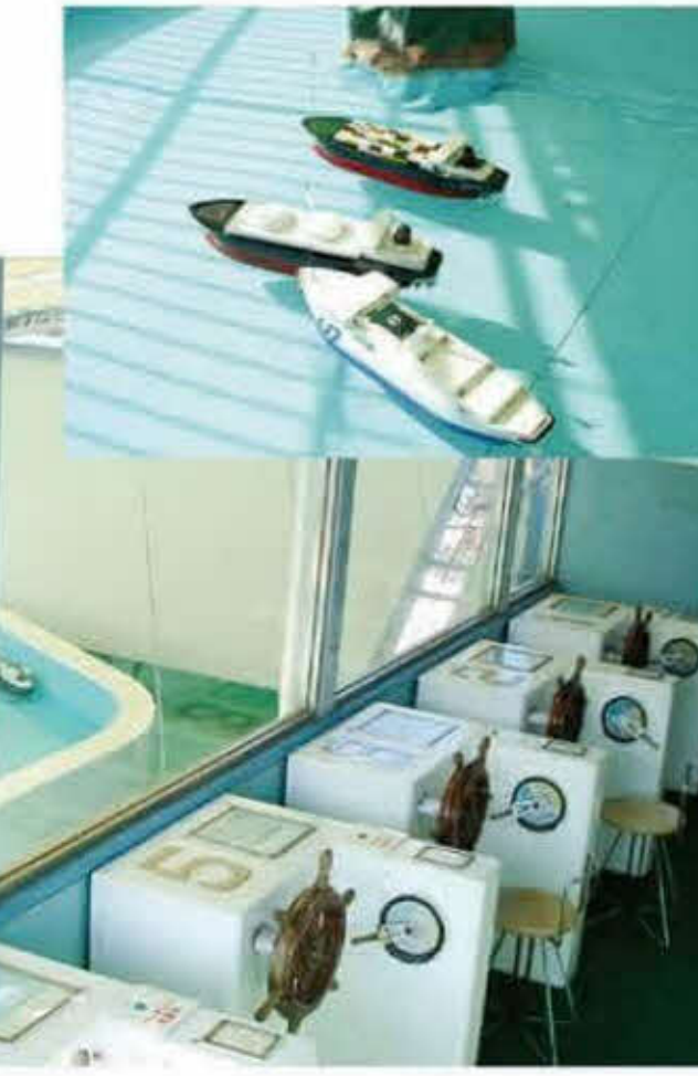
▲ Radio control ship corner