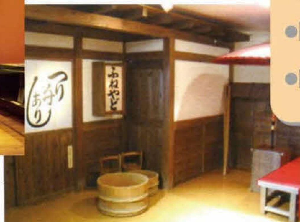
▲ Sailor's Inn, Boat House