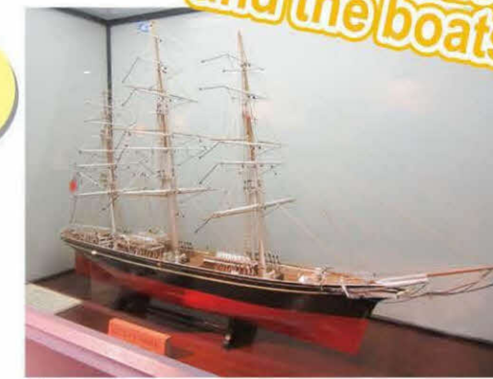
▲ Cutty Sark

Interact with the sea and the boats during fun events