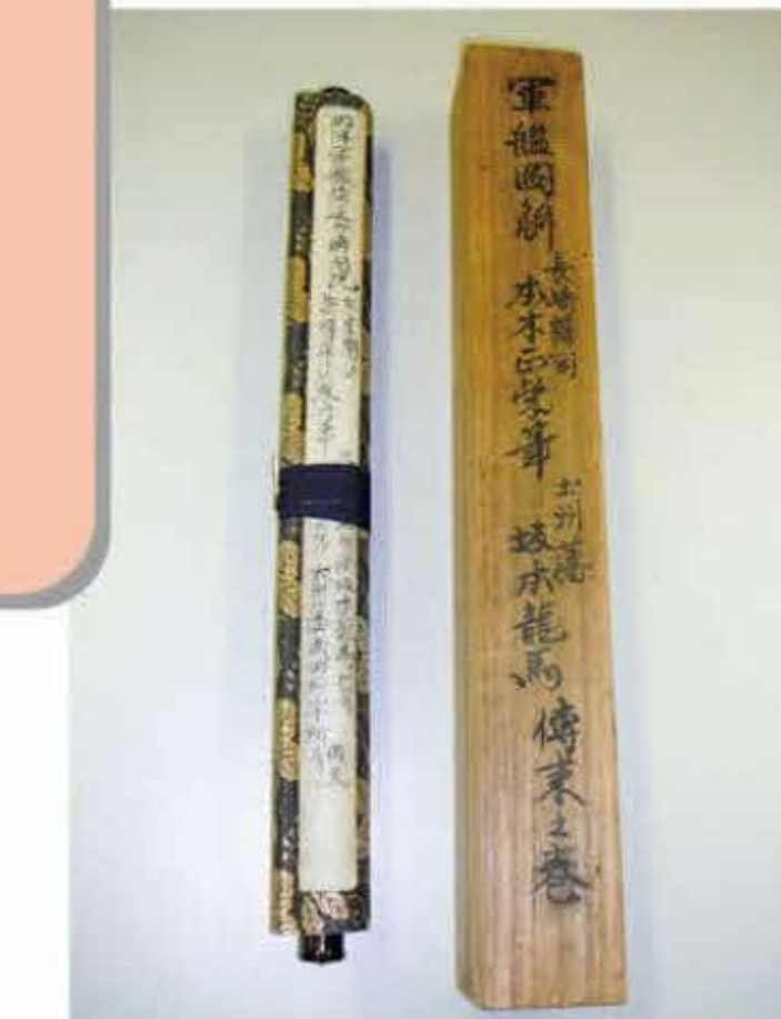
▲ Western warship structural decomposition diagram