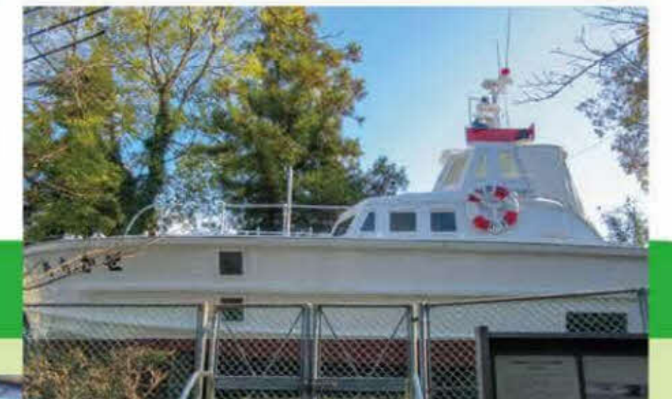
▲ JCG Arakaze