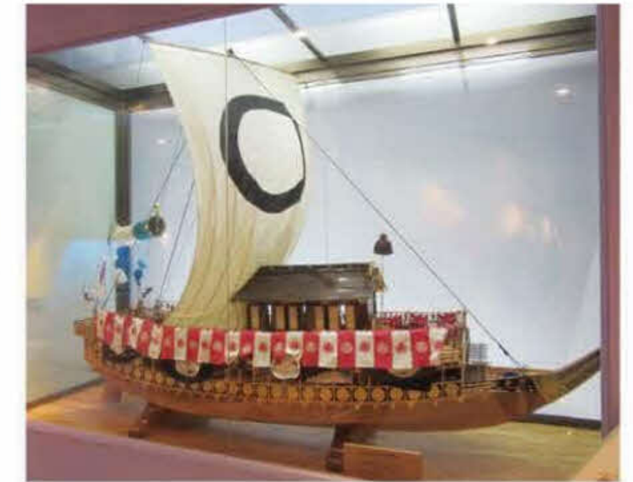
▲ Gozabune Officer's Ship of the Takamatsu Clan, Hiryu Maru

Interact with the sea and the boats during fun events