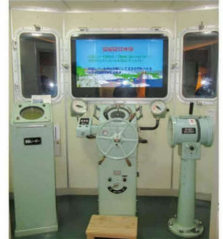
▲ Ship handling simulator