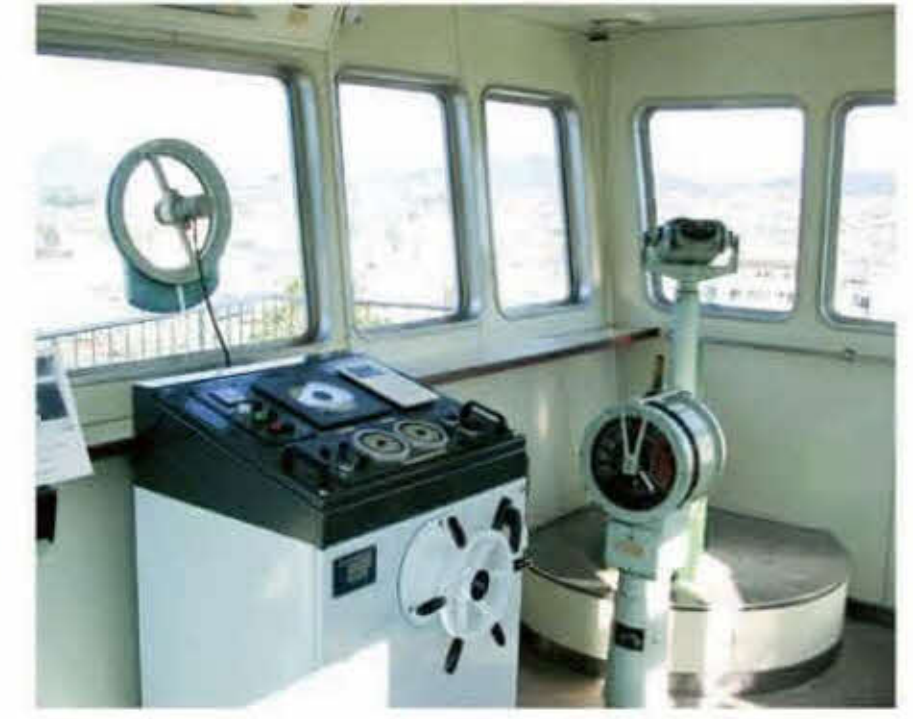
▲ Viewpoint (wheelhouse)