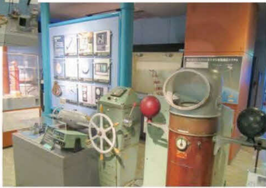
▲ Past and present of marine tools

Immerse in the Edo emotion with the busy townscapes