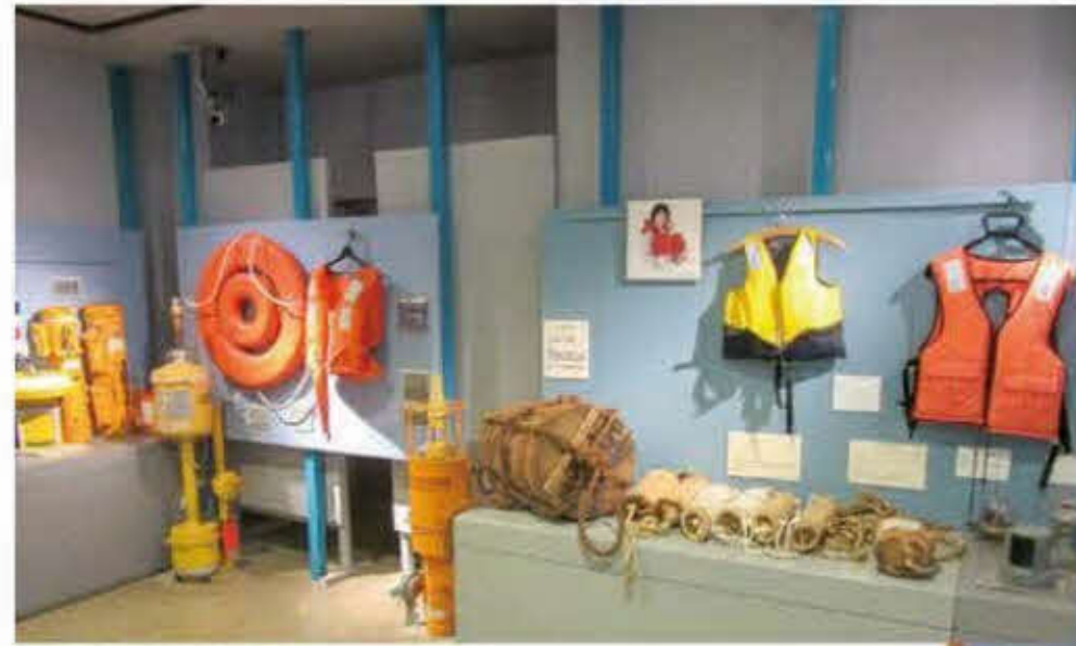
▲ Ship's life-saving equipment