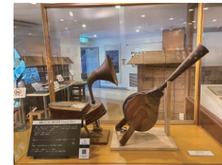
▲ Fog Horn