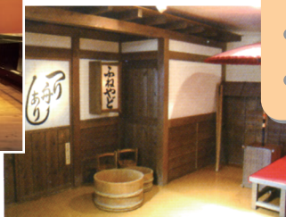
▲ Sailor's Inn, Boat House