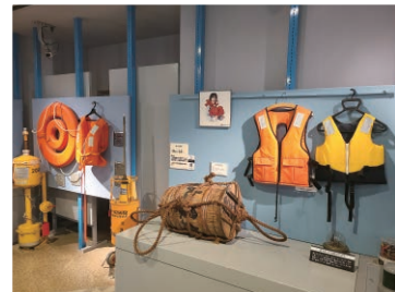
▲ Ship's life-saving equipment