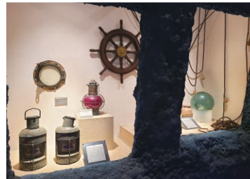
▲ Past and present of marine tools