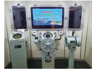
▲ Ship handling simulator