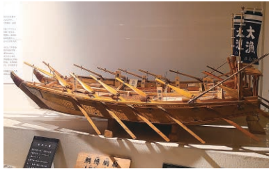
▲ Sea bream net fishing boat