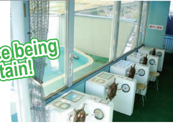
▲ Radio control ship corner