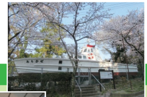
▲ JCG Arakaze

Interact with the sea and the boats during fun events