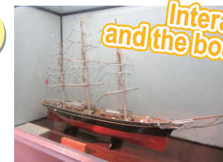
▲ Cutty Sark

Interact with the sea and the boats during fun events