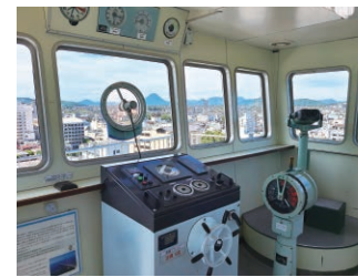
▲ Viewpoint (wheelhouse)