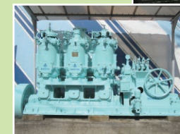
▲ Hot bulb engine