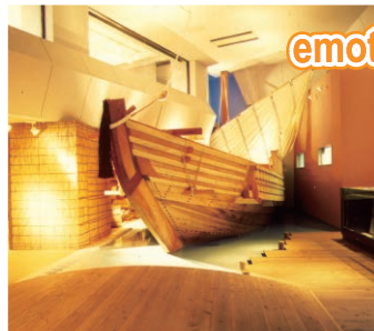
▲ Konpira Ship

Immerse in the Edo emotion with the busy townscapes