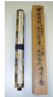
▲ Western warship structural decomposition diagram