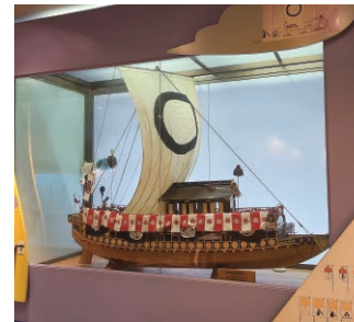
▲ Gozabune Officer's Ship of the Takamatsu Clan, Hiryu Maru